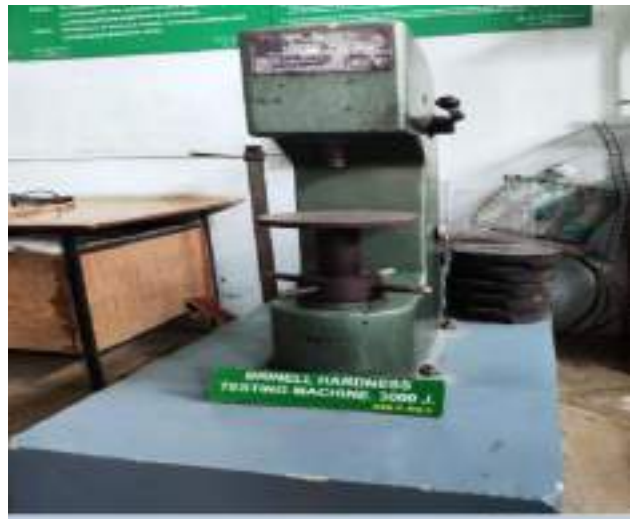
Brinell 3000 J Hardness Testing Machine Manufacturer- FIE. Ichalkarangi Application- Measure the hardness of castings, forgings, other metals and alloys.