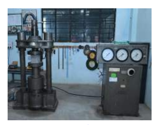
Compression Testing Machine Manufacturer-Associated Instrument Manufacturers (INDIA) Pvt. Ltd. Capacity- 2000KN Application- Compression Test