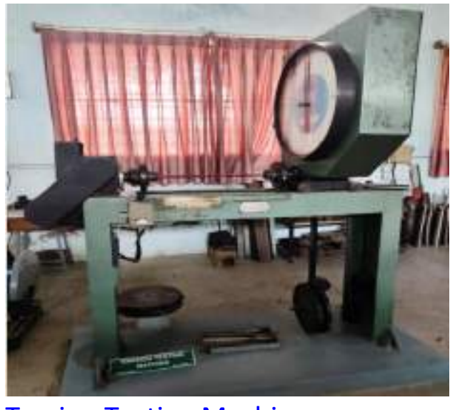
Torsion Testing Machine Manufacturer- FIE. Ichalkarangi Application- conducting torsion and twist on various metal wires, tubes, sheet materials

Manufacturer - ASI Sales Private Limited Aplication - Static bending test, Shear test parallel to grain.