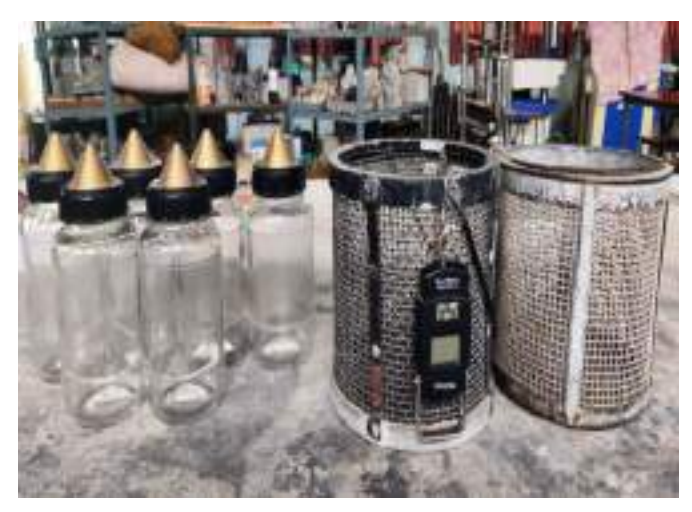
Pycnometer and Density bucket Manufacturer- AIMIL Application- Specific gravity of aggregate