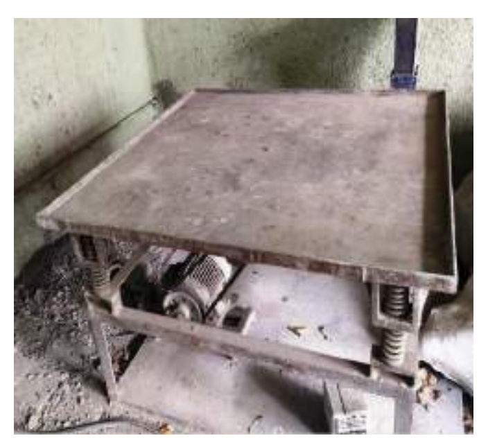
Vibration Machine Manufacturer- AIMIL Vibration of fresh concrete moulds