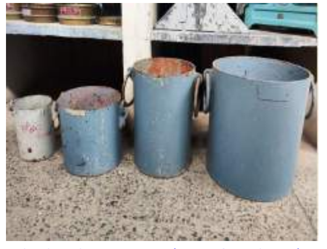
cylindrical containers (3, 15 & 30 litres) Manufacturer- Oriental Scientific Instruments Corporation.

Application - Bulk density of aggregate.