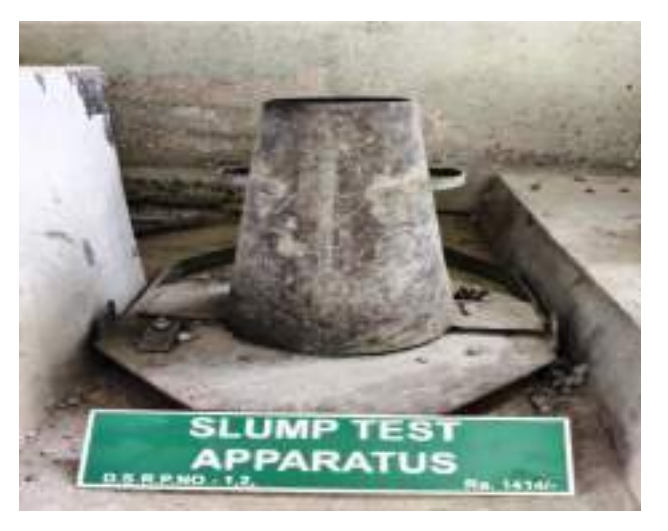
Slump Cone Test Apparatus Supplier- Lawrence Mayo New Delhi Application- To determine workability of concrete