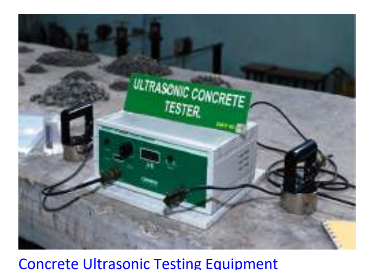
Manufacturer- Canopus Instruments Application- For estimating the strength and uniformity of beams, coloumn and slabs. Detecting honeycombing and porosity in slabs, deterioration of the concrete in old buildings.