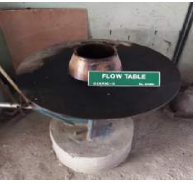
Flow Table Test Apparatus Manufacturer- AIMIL Application- To determine workability of concrete.