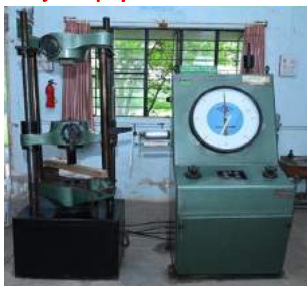
Universal Testing Machine (Analogue) Manufacturer-Fuel Instruments & Engineers Pvt. Ltd. (FIE) .Capacity- 400KN Application-Tension Test, Compression Test, Bending Test, Shear Test.