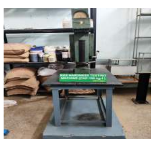
Ras Hardness Testing Machine Manufacturer- FIE. Ichalkarangi Application- for testing hardness of metals & alloys