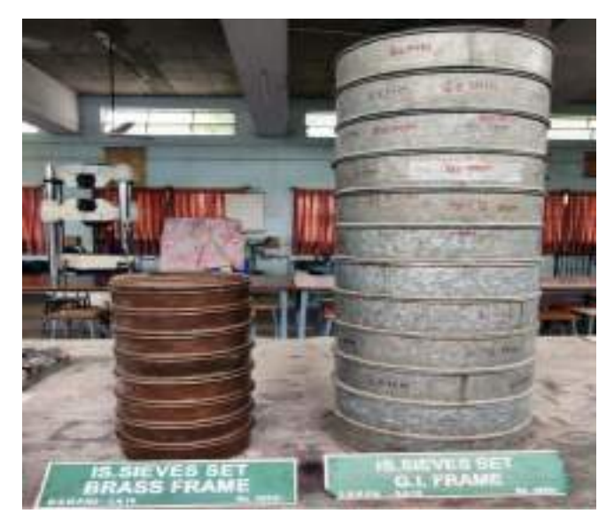
IS Sieves Brass and G.I Manufacturer- AIMIL Application- Fineness modulus and grading of aggregate.