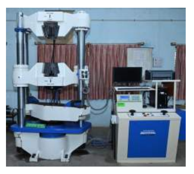
Universal Testing Machine (UTM)- computerized Manufacturer- Fine Spavy Associates & Engineers Pvt. Ltd. Capacity- 1000KN Application- Tension Test, Compression Test, Bending Test, Shear Test, Bend Re-bend Test