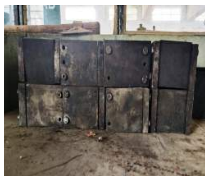
Cement Mold Size 70.6mmx70.6mmx70.6mm Make –AIMIL Application- To prepare the cement cube