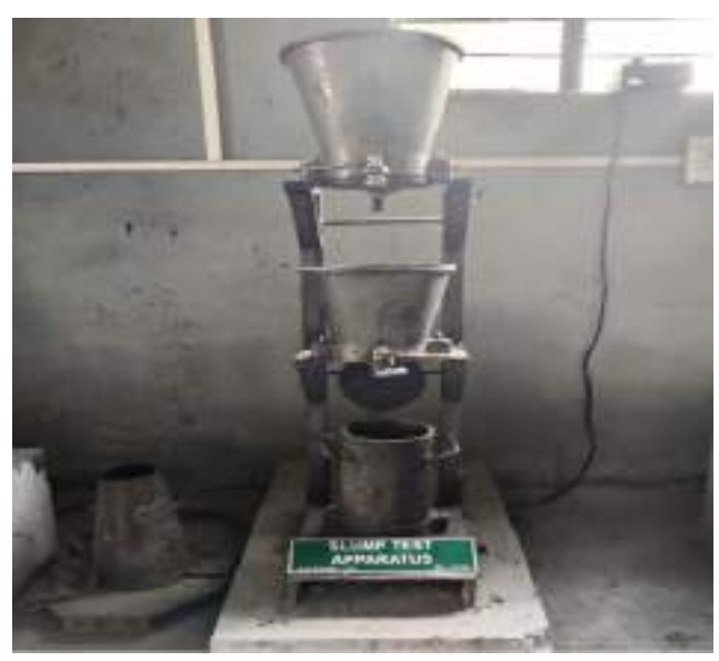
Compaction Factor Apparatus Manufacturer- AIMIL Application- To determine workability of concrete