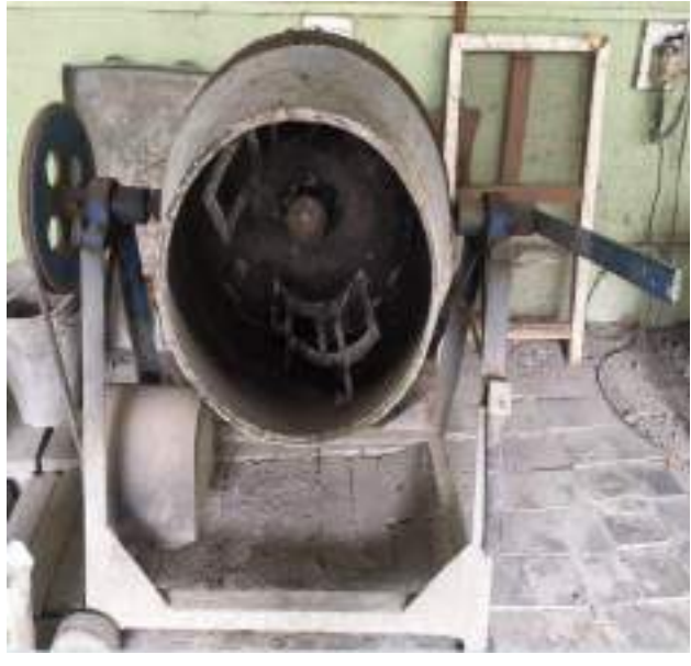
Concrete Mixture Manufacturer- AIMIL Application- To mix the concrete