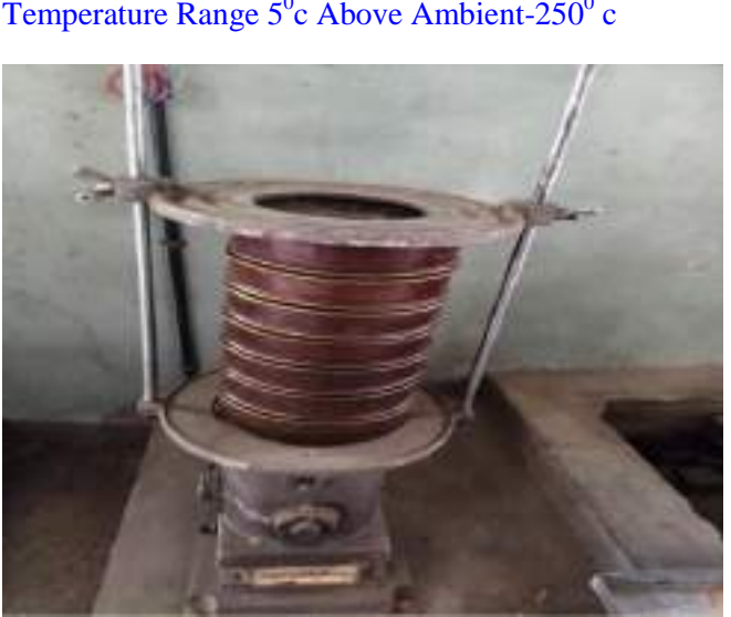
Sieve Shaker Manufacturer- ASI Sales Private Limited Analysis of fine aggregates.