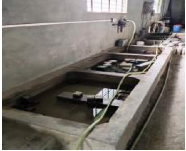
Curing tank Application - To curing the cement and members.