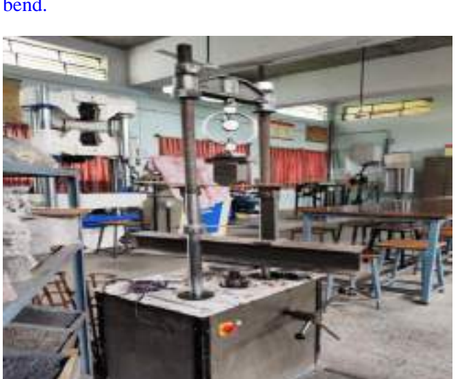
Universal Wood Testing Machine

Application - Tensometer can be used to test a verity of materials such as metals, plastic, timber, ceramics, cement, fabrics, etc. in tension, shear, compression and bend.