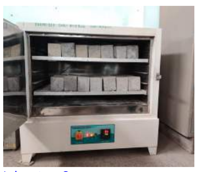
Laboratory Oven Manufacturer - LABSTAR. Digital controller, Air circulation fan with motor. Temperature Range 5°c Above Ambient-250° c