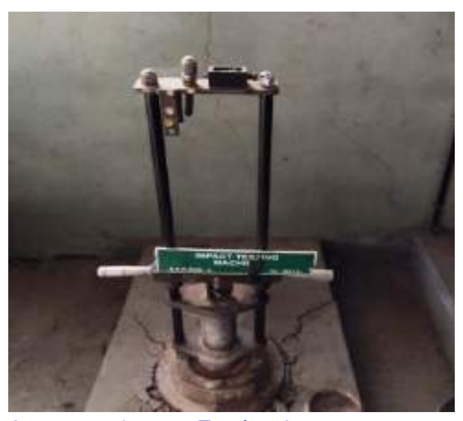
Aggregate Impact Testing Apparatus Manufacturer- ASI Sales Private Limited Application- To to know the toughness of aggregate