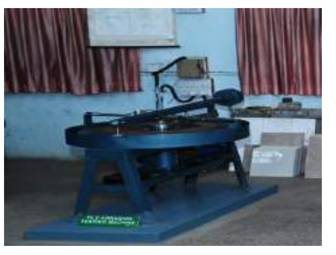
Tile Abrasion Testing Machine ManufacturerHydraulic & Engineering Instruments (HEICO) Application- To check Wear and Tear of cement concrete Flooring tiles.