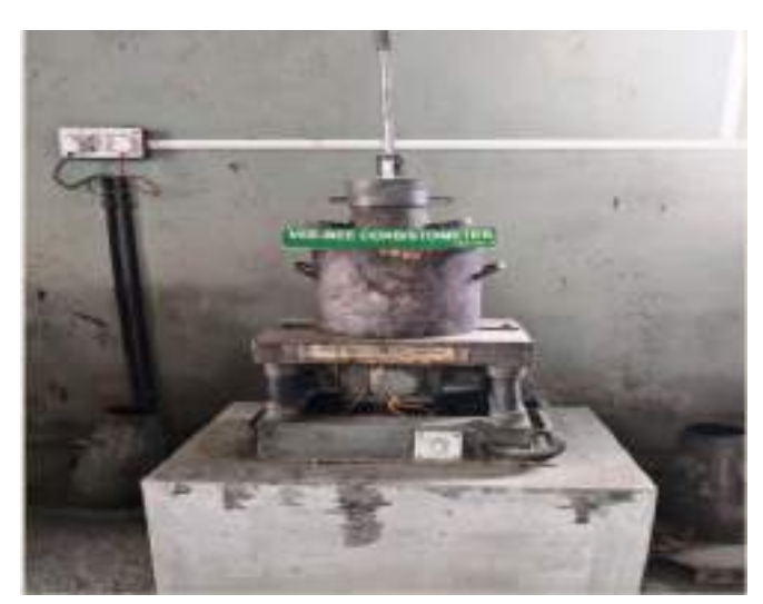
Vee Bee Consistometer Manufacturer- ASI Sales Private Limited Application- To determine workability of concrete