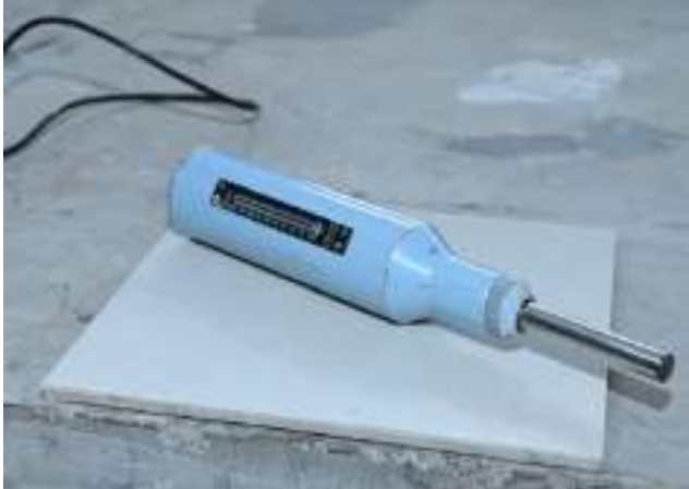
Rebound Hammer Manufacturer- ASI Sales Private Limited Application- To investigate concrete hardness, estimating the compressive strength.