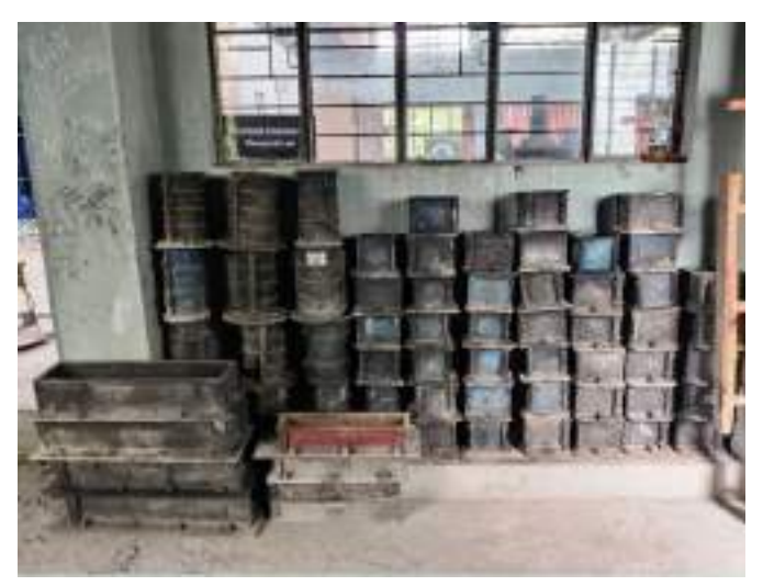
Concrete Moulds (Cube and Beam molds) Supplier - Lawrence& Mayo New Delhi Application - To prepare concrete Cube, Beam and cylinder.