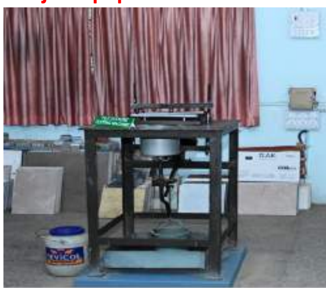
Tile Flexure Strength Testing Machine Manufacturer- Associated Instrument Manufactures Pvt.Ltd. Capacity-200kg Application- To check the flexure strength of cement concrete flooring tiles, clay roofing tiles (Mangalore pattern).