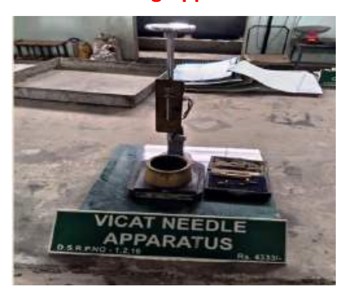
Vicat Apparatus Manufacturer- ASI Sales Private Limited. Application- To find standard consistency, Initial and final setting time of cement.