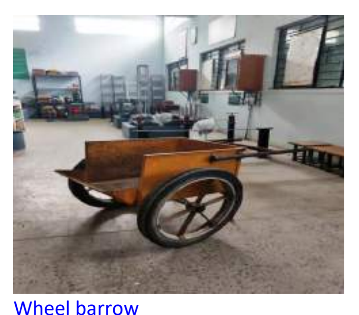
Manufacturer- Bhai Bhai Engineering Works, Sai Baba Shopping Complex.