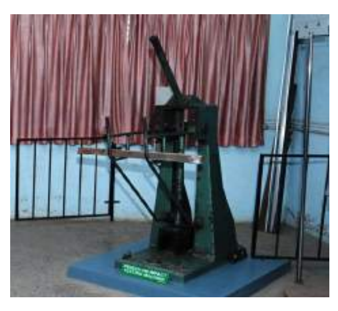
Impact Testing Machine( Charpy and Izod Test) Manufacturer- Fuel Instruments & Engineers Pvt.Ltd. Application- To determine the behaviour of metals especially steel and steel castings under Impact stresses