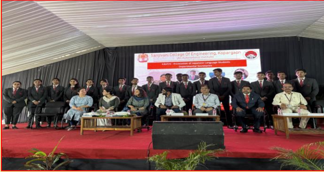
Event Organized on 12 th October 2023, Guest: Hirameki Solutions and Team